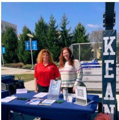
KEAN UNIVERSITY CAREER DAY