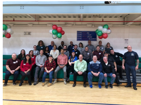
D1 HOLIDAY PARTY

Hunterdon, Morris, Somerset, Sussex and Warren Counties