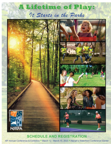
SCHEDULE AND REGISTRATION