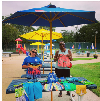
BATHING SUIT AND GOGGLE DRIVE