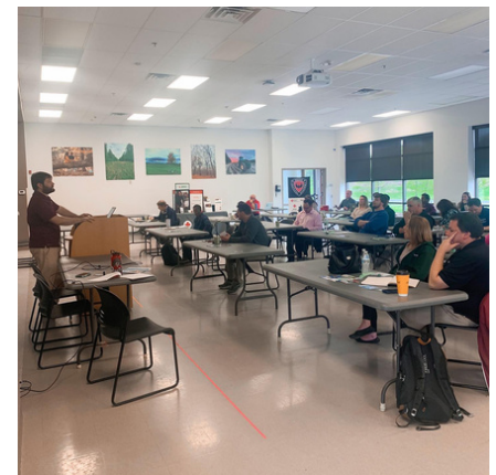
AQUATICS SPRING WORKSHOP