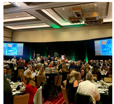
TUESDAY AWARDS BANQUET