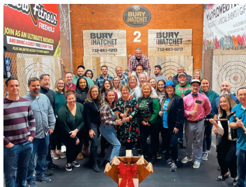
D4 HOLIDAY PARTY