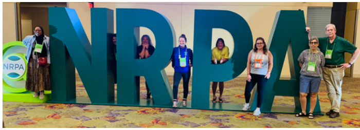
2022 PHOENIX CONFERENCE