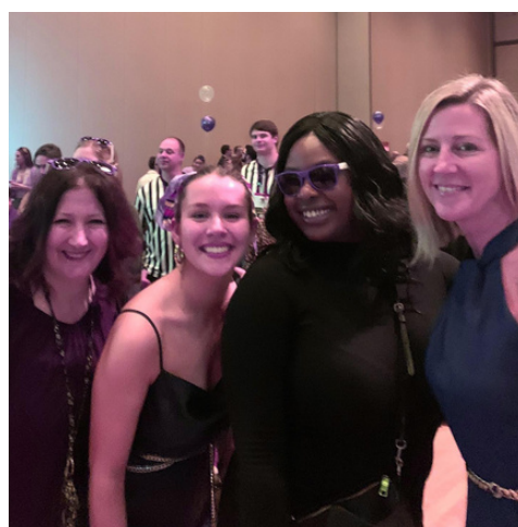
ALL DELEGATE SOCIAL