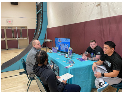
D3 VENDOR SPEED DATING & MORE EVENT