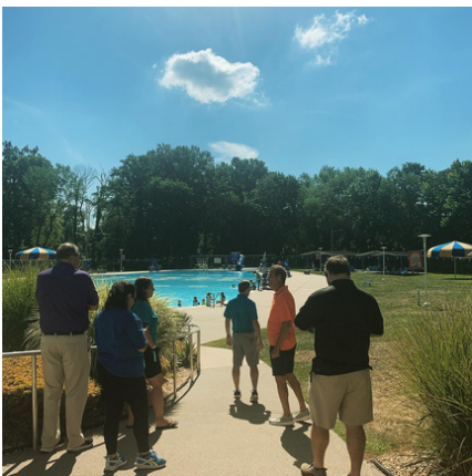
POOL SCHOOL - CLARK POOL

Aquatics hosted a 2022 Bathing Suit & Goggle Drive. The drive collected over 400 bathing suits and goggles that were given to the communities of Newark, Orange, Jersey City and Perth Amboy. Other events included Certified Pool Director trainings with Montclair State University, Pre-conference Workshop and Summer Pool School. The Aquatics Spring Workshop with 39 attendees and don't forget May is Water Safety Month Proclamation.