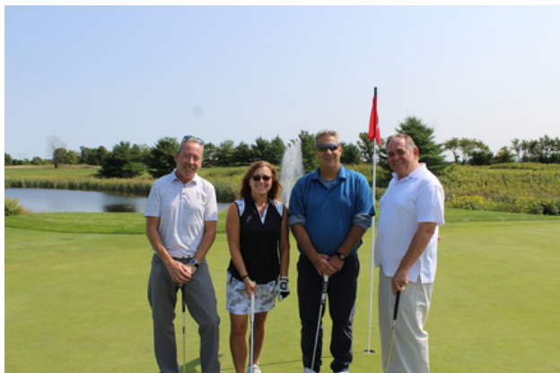
HERON GLEN GOLF OUTING