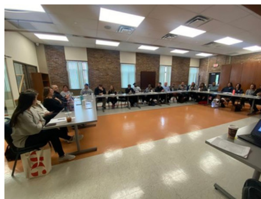
CYSA TRAINING WITH NAYS