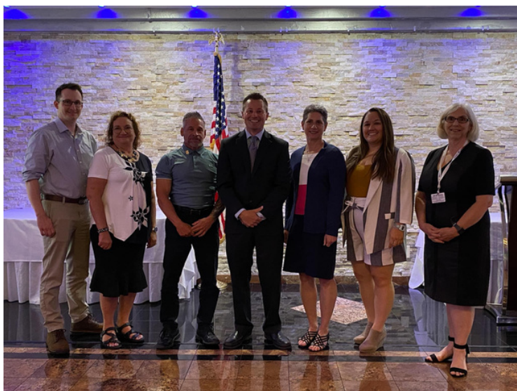
2022-2023 EXECUTIVE BOARD OF TRUSTEES